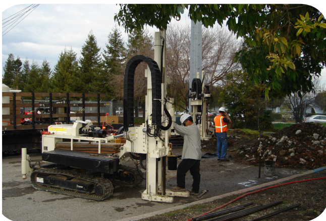
Injection of vegetable oil underground to improve conditions for bioremediation.

Bioremediation has successfully cleaned up many polluted sites and has been selected or is being used at over 100 Superfund sites across the country.